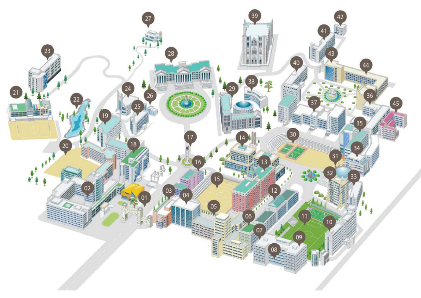
Seoul Campus Map (https://www.khu.ac.kr/eng/sub/tab.do?MENU_SEQ=1000658&TAB_SEQ=1000660)

Sewha Hall opened as an on-campus housing community in early 2005. It has a capacity of welcoming 434 both Korean and international students. Each room is double occupancy, equipped with a bathroom, air conditioning, beds, wardrobes, bookshelves and desks. The room also has a mini-fridge and a sink. Shared facilities include study rooms, seminar rooms, student lounges, laundry rooms, a convenience store and a fitness center.