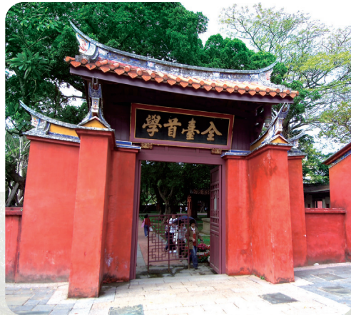
Tainan Confucius Temple

Tainan is the ancient capital of Taiwan, and is proudly the home to a total of almost 2,000 historic Taoist or Buddhist temples. This city continues to host a variety of cultural festivities and religious ceremonies all year round. Traditions have been well sustained in this modernized city. The city's gourmet food culture guarantees one can find delicious food of every kind. Life in Tainan has a charming balance between the new and the old, and the fast and the slow.