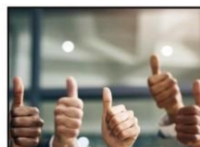
Other Supporting Documents