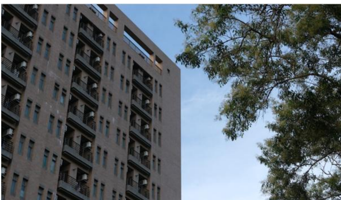
Ching Yeh Dorm