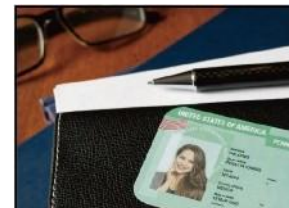
Photo ID Both Sides