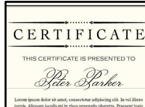
Home University Enrollment Certificate