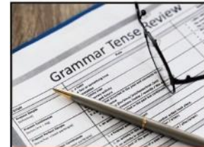
Latest official English transcript