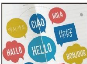
Chinese/English Proficiency Certificate