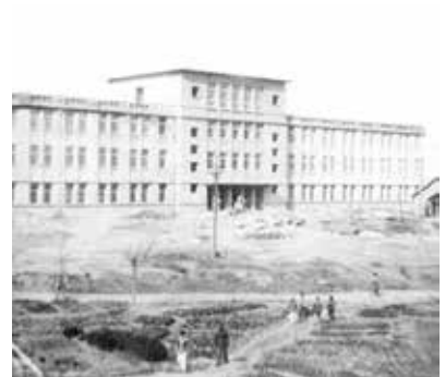
A new library being built on CCNU's new campus on Guizi Hill, circa 1961.