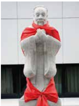
A statue of Confucius now stands at University of Newcastle.